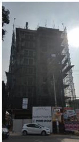
Prime 194 Nugegoda (Apartment) Client : RO-PA Constructions