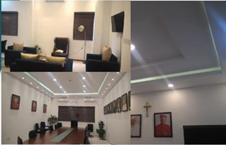
St. Peters College, Colombo. Client : JJ Aaron Richard Company Pvt Ltd