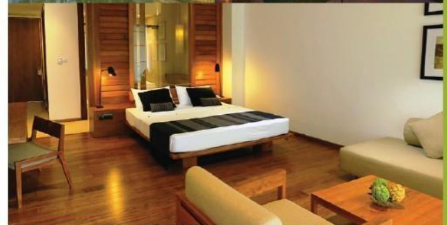
Pandanus Beach Resort and Spa, Induruwa. Client : NC Constructions