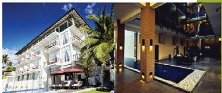
Garton Cape Hotel Client : JCK Constructions