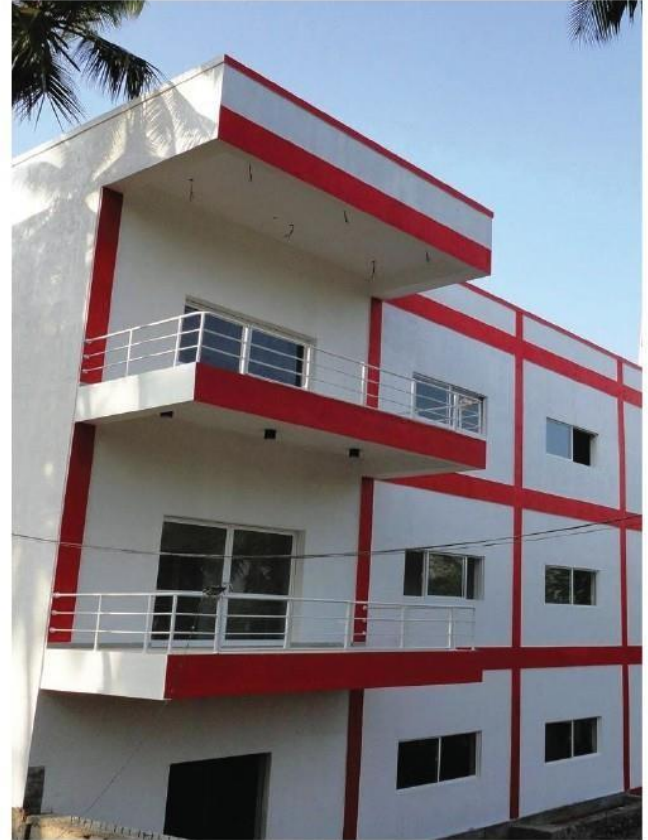
Main Switching Centre : Disaster Recovery of Airtel Sri Lanka. Rammugala Client : Access Telecommunications (Pvt) Ltd.