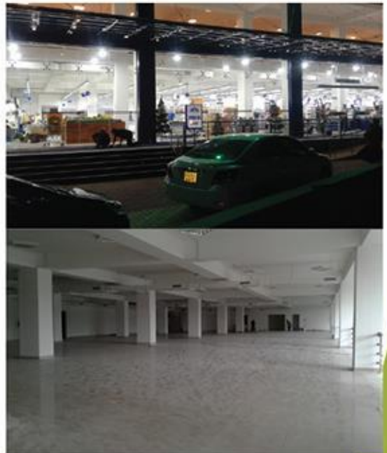
Arpico Super Center (Kurunegala) Client : Senula Constructions