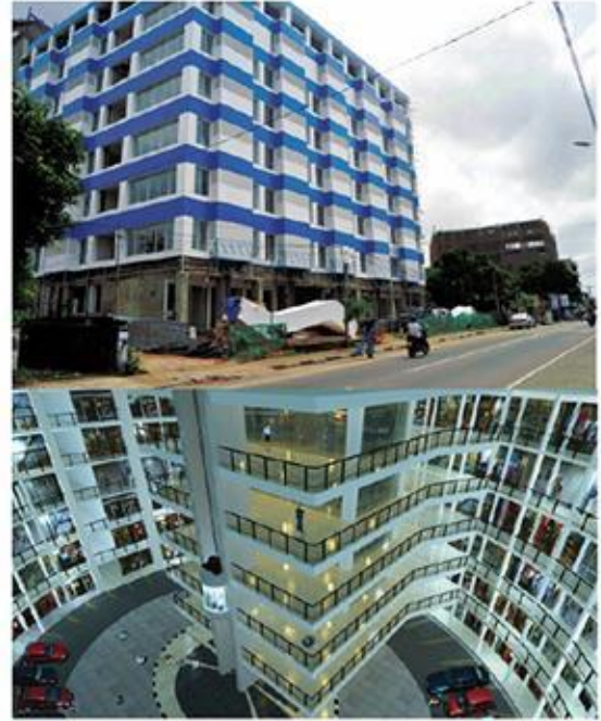
Ward City, Gampaha. Client : Gampaha Development Company (Sanosa)