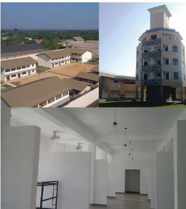
Angunakolapelessa Prison Complex