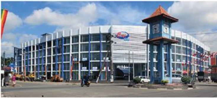
Orex City, Ekala Client : Gampaha Development Company