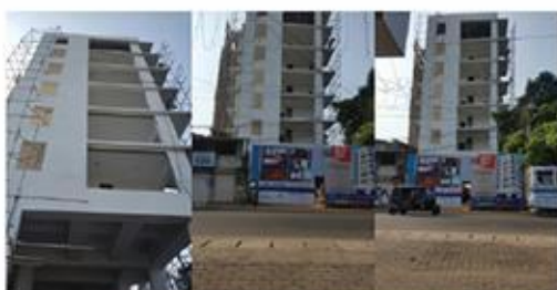
Skyline Kotte (Apartment) Client : Skyline Property Developers