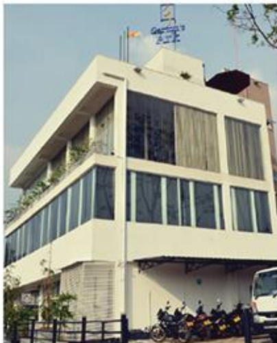
Utility Building for Garton's Ark Floating Restaurant Client : JCK Constructions