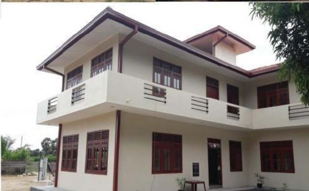
Bungalow for Holly Cross Trust, Eluthumadduval. Client : JJ Aaron Richard Company Pvt Ltd