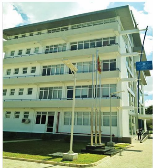
The Regional Support Centre (Western South) of National Water Supply & Drainage Board, Rathmalana

Client : Central Engineering Services (Called as CICB before)